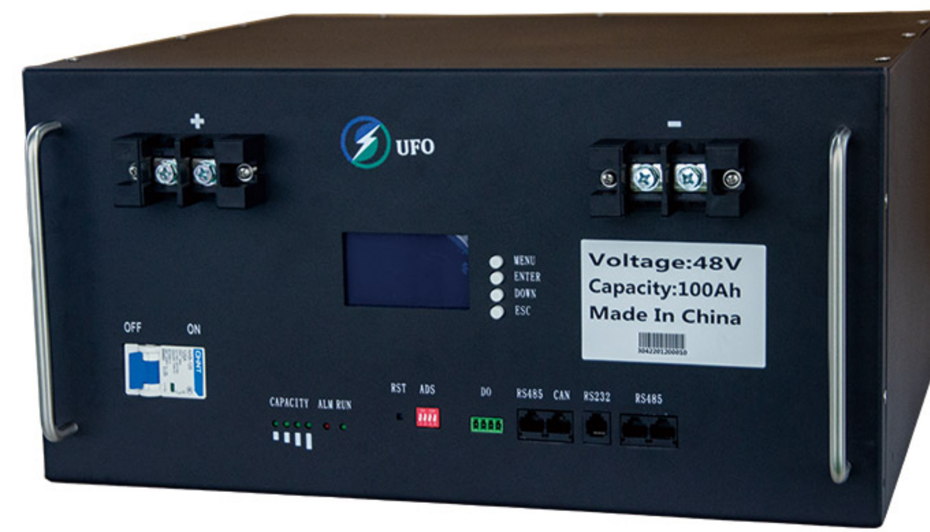
UFO LifePO4 BATTERY SPECIFICATIONS